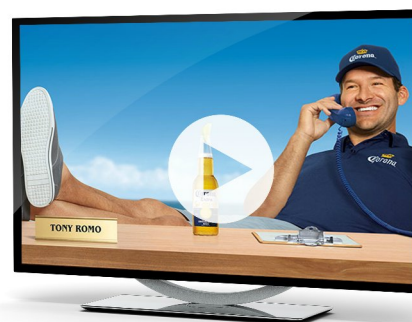
Tony Romo joined Team Corona Extra as the operator and face of the fan-favorite Corona Hotline.