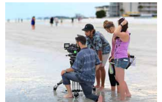
Filming on the gulf coast