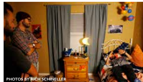
Production design created a social media inspired pelette, as seen in Stephen Blatt's bedroom

The multi-disciplinary nature of this Studio Lab production seamlessly integrated not just the Film Program but all fields of study at Ringling College.