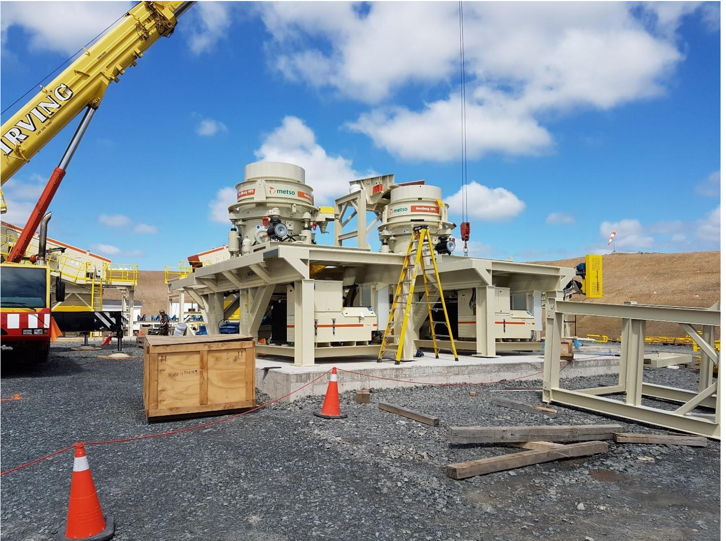
HP 5 cone crushers: