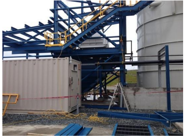
Ball mill drive assembly, ball mill feed chute: