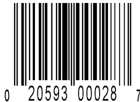
2059300028 MARY B's THIN BUTTERMILK BISCUITS 28.6OZ 22 / 1.3OZ