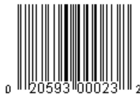
2059300023 MARY B's BUTTERTASTE VALUE PACK BISCUITS 44OZ 20 / 2.2OZ