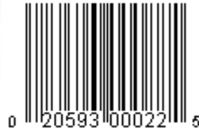
2059300022 MARY B's BUTTERMILK TEA BISCUITS 24OZ 24 / 1OZ